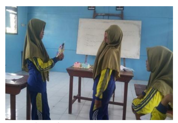
Figure 2. observations and tests

Below is the value of English for eighth-grade students of MTs. Muhammadiyah 10 Wukir about Expression of Like and Dislike with the topic of favorite foods and beverages, before using the Lolly-pop Card media: